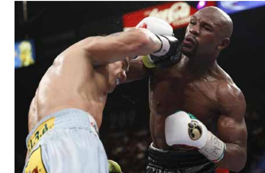
Floyd Mayweather Jr., right, trades punches with Marcos Maidana, from Argentina, in their WBC-WBA welterweight title boxing fight Saturday, May 3, 2014, in Las Vegas.

In the end, though, Mayweather got the win - just as he did in his previous 45 fights in a decision that was met with disbelief by Maidana and booed heavily by