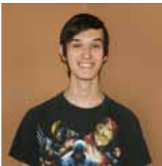
By Isaiah Torres tú Decides correspondent