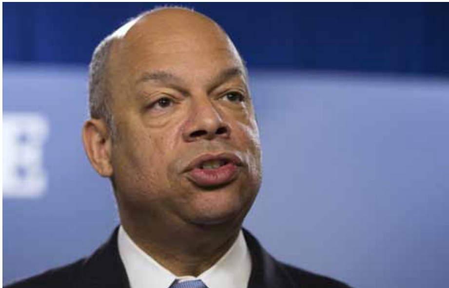
This March 18, 2014 file photo shows Homeland Security Secretary Jeh Johnson speaking in Washington.