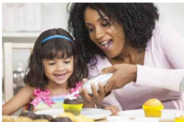
TRADITIONS: Tips for celebrating Mother's Day on a budget > 22

An interview with comic book legend Stan Lee by Isaiah Torres > 23