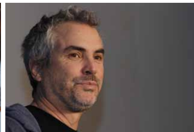
LATIN AMERICA: Alfonso Cuarón questions Mexican president > 17