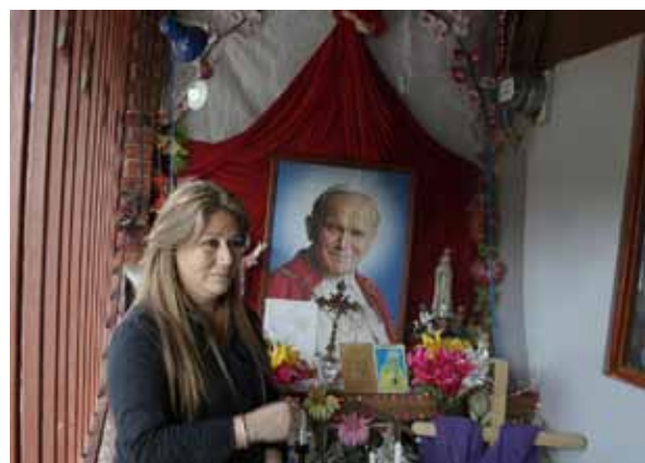
LATIN AMERICA: Costa Rican a celebrity after miracle > 19