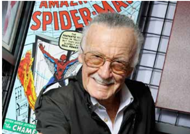
Stan Lee, creator of Spider-Man.

This week the Amazing Spider-Man 2 opened in theaters everywhere and we thought this would be a great time to interview Stan “The Man” Lee.