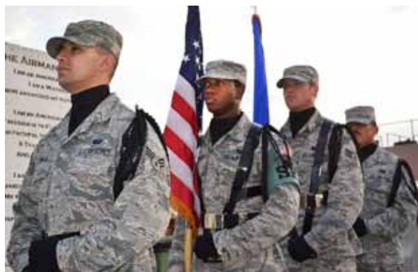
STATE: Student values support for veterans > 22

Thousands rally, march in nationwide anti-Trump protests > 23