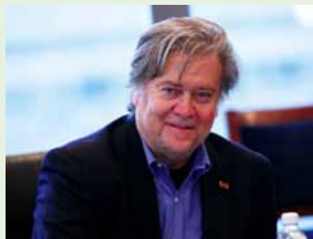
Steve Bannon, the 62-year-old former CEO of Trump's campaign, will serve as the future president's chief strategist.

Bannon joined Trump's election team as chief executive late in the campaign, following the departure of Trump's second campaign team in August. He