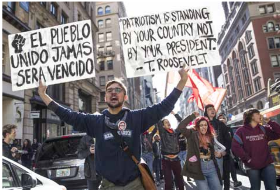
Demonstrators march up Fifth Ave during a protest against the election of President-elect Donald Trump, on Saturday, November 12, 2016, in New York City.

gathered outside CNN's Los Angeles headquarters, and in San Francisco, hundreds of people, including many families with children, marched from Golden Gate Park to Ocean Beach chanting