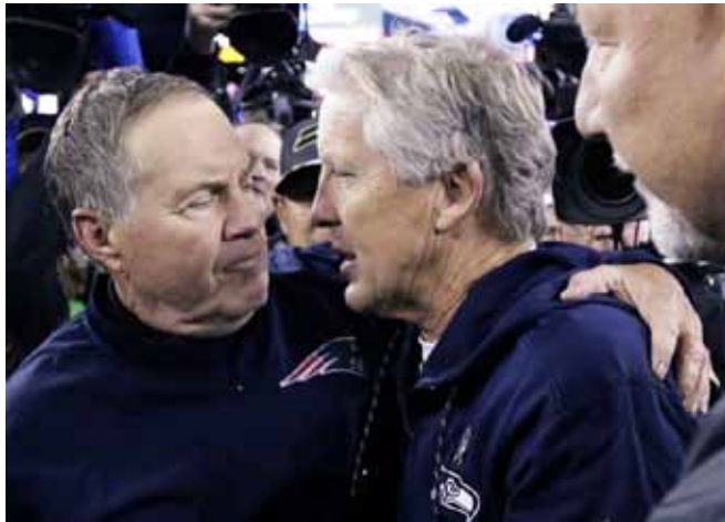
New England Patriots head coach Bill Belichick, left, and Seattle Seahawks head coach Pete Carroll speak at midfield after an NFL football game, Sunday, November 13, 2016, in Foxborough, Massachusetts.

cally been at his best outside the pocket, making plays with his feet. Leg injuries have kept him in the pocket recently, but he was still effective in keeping the Patriots' defense guessing.