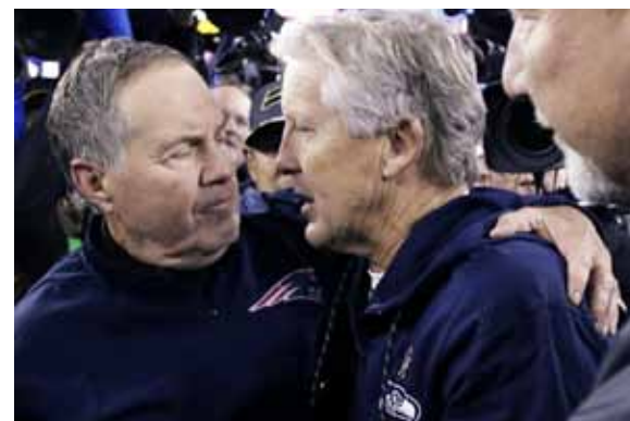
DEPORTES: Seahawks find some balance in win > 16