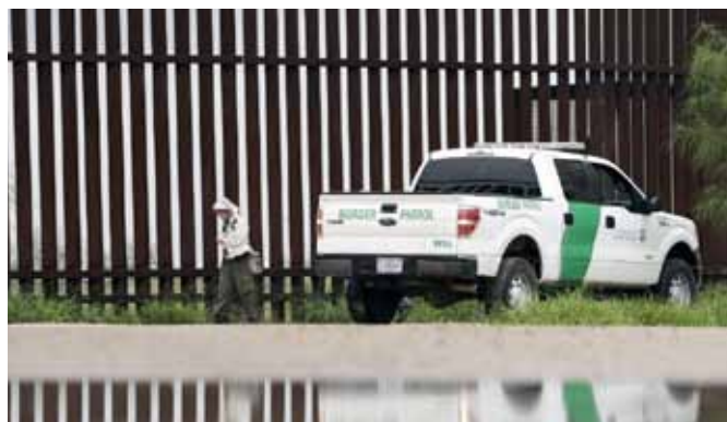
IMMIGRATION: Trump starting to sound like Obama on immigration > 19