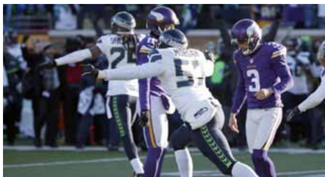
SPORTS: Seahawks edges Minnesota, move on to play Carolina > 22

Mexico launches process to extradite 'El Chapo' Guzman to US > 23