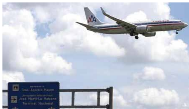
NATIONAL: U.S. and Cuba to resume commercial flights > 17