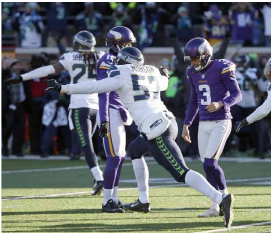
Minnesota Vikings kicker Blair Walsh (3) reacts after missing a field goal during the second half of an NFL wild-card football game against the Seattle Seahawks, Sunday, January 10, 2016, in Minneapolis, Minnesota.

Carroll said the plan will remain the same with Lynch this week and he'll be evaluated daily. But there is no projection on whether he'll play against the Panthers. Lynch had 54 yards on 17 carries and a touchdown when Seattle faced Carolina in the regular season.