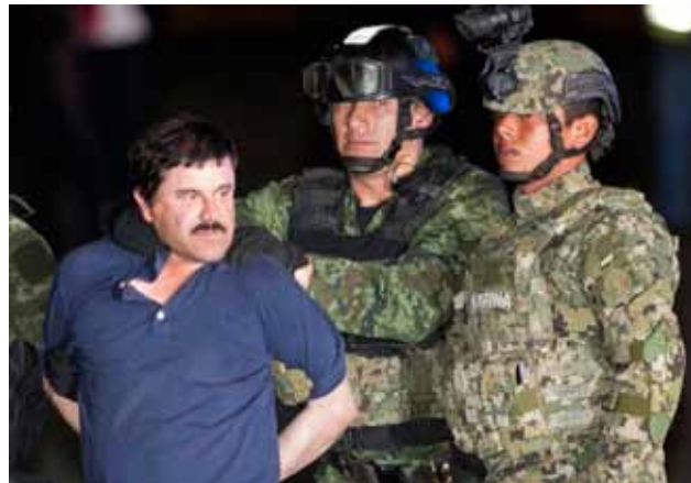
Joaquin "El Chapo" Guzman is made to face the press as he is escorted to a helicopter in handcuffs by Mexican soldiers and marines at a federal hangar in Mexico City, Mexico, Friday, January 8, 2016.

The Attorney General's Office said in a statement that Guzman was formally informed that he was wanted in the U.S. The notification was done by Mexican agents assigned to the international police agency Interpol, who served two arrest warrants to the drug lord. Guzman's defense now has three days to present arguments against extradition and 20 days to present supporting evidence,