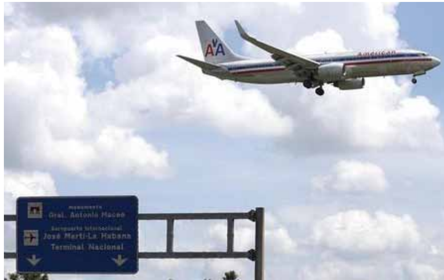
An American Airlines airplane prepares to land at the Jose Marti International Airport in Havana, Cuba, on September 19, 2015.