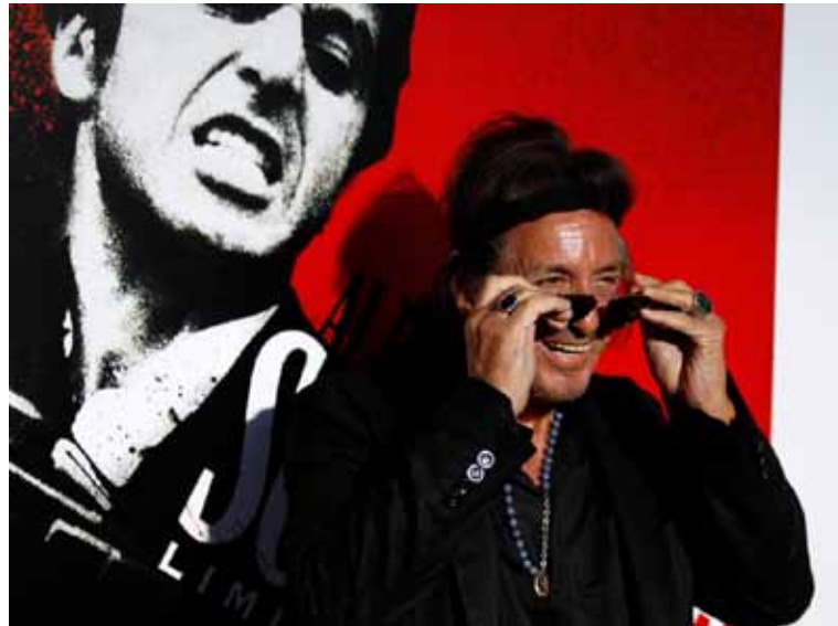
In this Tuesday, August 23, 2011 file photo, actor Al Pacino arrives at the “Scarface” Legacy Celebration Event in Los Angeles, California.

Denzel Washington starred in this 2007 movie as Frank Lucas, who takes over after his boss dies and becomes a key heroin drug lord in Harlem.