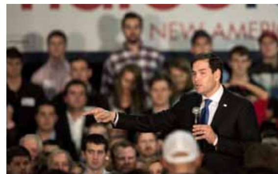
POLITICS: Radical turnaround for Rubio on immigration > 15