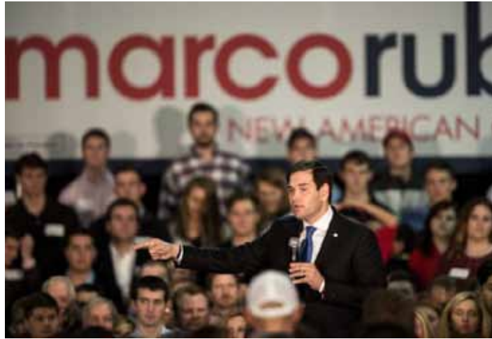
Marco Rubio speaks during a campaign event in Raleigh, North Carolina, on January 9, 2016.

But in recent weeks, Rubio also has shifted the conversation, starting the immigration segment of his stump speech by painting gaps in the U.S.-Mexico