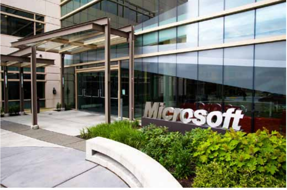
Entrance to Building 99 on the Microsoft Redmond Campus in Redmond, Washington.

soft announced following the takeover of Nokia's Devices and Services unit impacted its mobile unit, and the firm said that the July 2016 round was