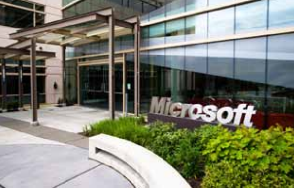
STATE: Microsoft confirms more layoffs, most in Redmond > 15