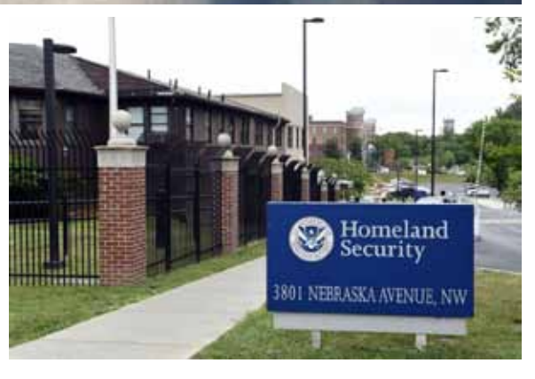
IMMIGRATION: Immigrants mistakenly granted citizenship > 14